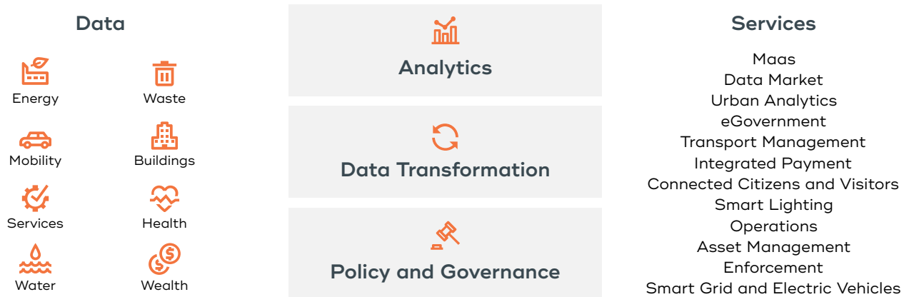
Figure 2. Smart Data Management